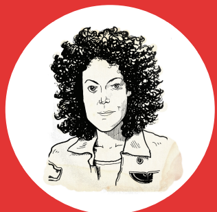
ELLEN RIPLEY WARRANT OFFICER

A TERRIBLE CURSE FELL ON PALAZZO MARESCOTTI: AT MIDNIGHT, THREE MYSTERIOUS FIGURES CAST A FORGOTTEN SPELL IMBUED WITH DARK POWERS.