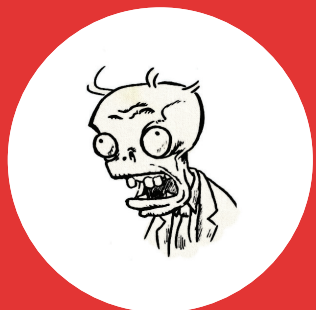
ZOMBIE BRAIN AND PLANT EATER