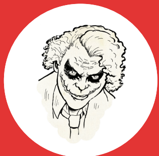
JOKER CRIMINAL MASTERMIND